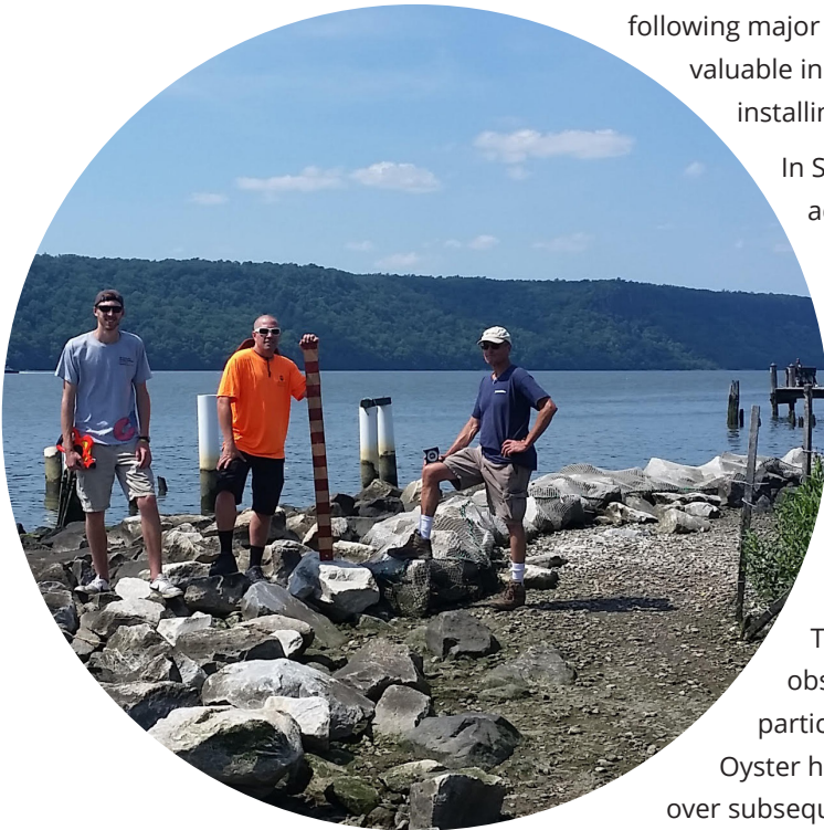
Testing a monitoring protocol at a living shoreline project in Hudson River Valley, NY.

shoreline assessment guidance and training land stewards in the protocol. Previous work also included conducting forensic analyses of living shoreline installments following major storm events. Both the guidance and forensic analyses have proven valuable in understanding what works well, and not so well, when it comes to installing living shorelines in New York.