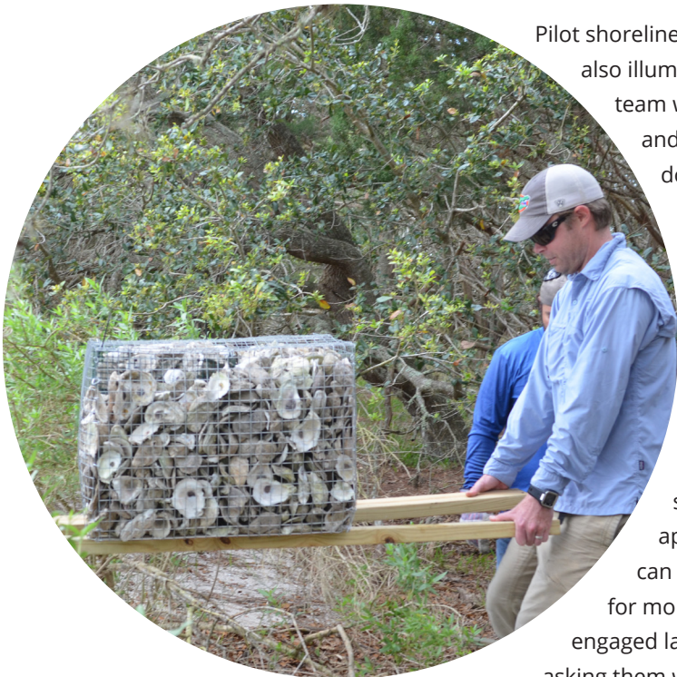
Carrying a cage of oyster shells that will provide oyster habitat as part of a living shoreline experiment at GTM NERR, FL.

In South Carolina, intertidal living shoreline projects have typically been installed by restoration practitioners along shorelines adjacent to public lands. To date, there hasn't been a straightforward permitting pathway for private property owners to proactively address shoreline erosion issues and protect habitat adjacent to their own properties. The state permitting agency approached the SCDNR and ACE Basin NERR and solicited their help in assessing existing living shoreline projects to inform