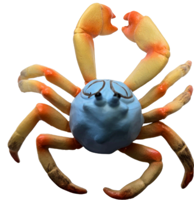
Beachball Kekada aquatus