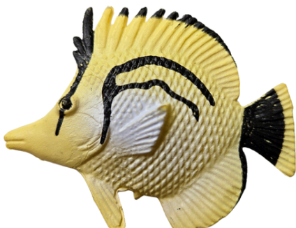
Spiky mohawk Samaka mohawki