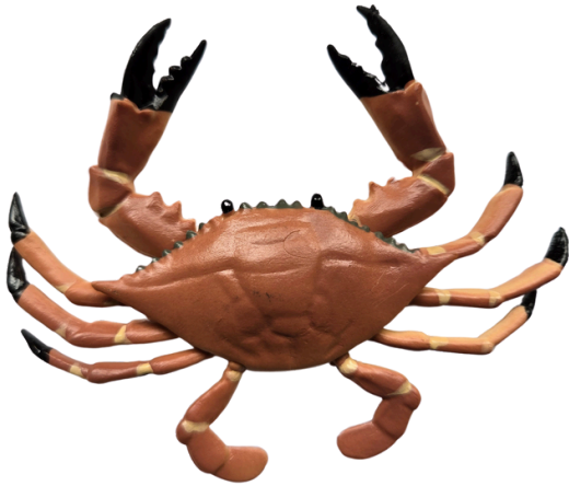
Girdie Krab typicalis