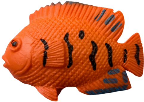
Orange watermeat Mulgogi orangie