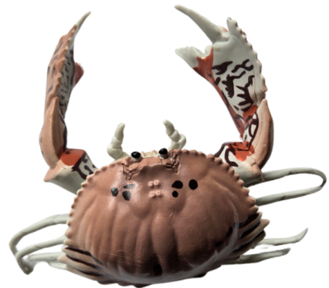
Muddy buddy Kekada aquatus