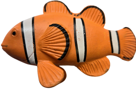
Orange watermeat Mulgogi orangie