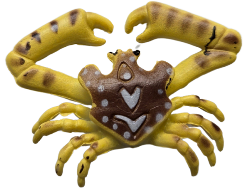
Popeye claw Kani pincheri