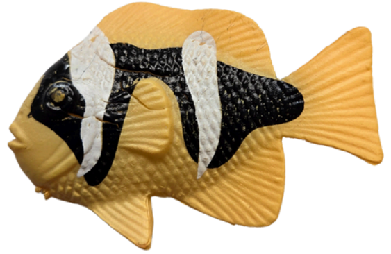
Yellow striper Pez stripus