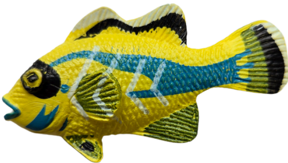
Capri sun Poisson tropica