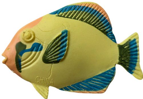
Capri sun Poisson tropica