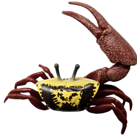
Popeye claw Kani pincheri