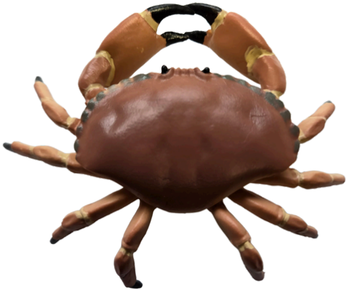
Girdie Krab typicalis