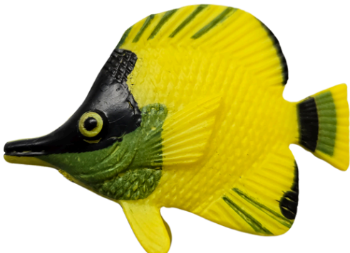
Faux hawk Samaka mohawki