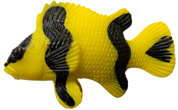
Yellow striper Pez stripus