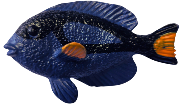
Dori dori Piscis dori