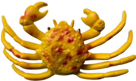
Dandelion pixie Pángxiè yellowie