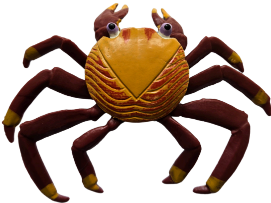
Purple eye Pángxiè eyeballie