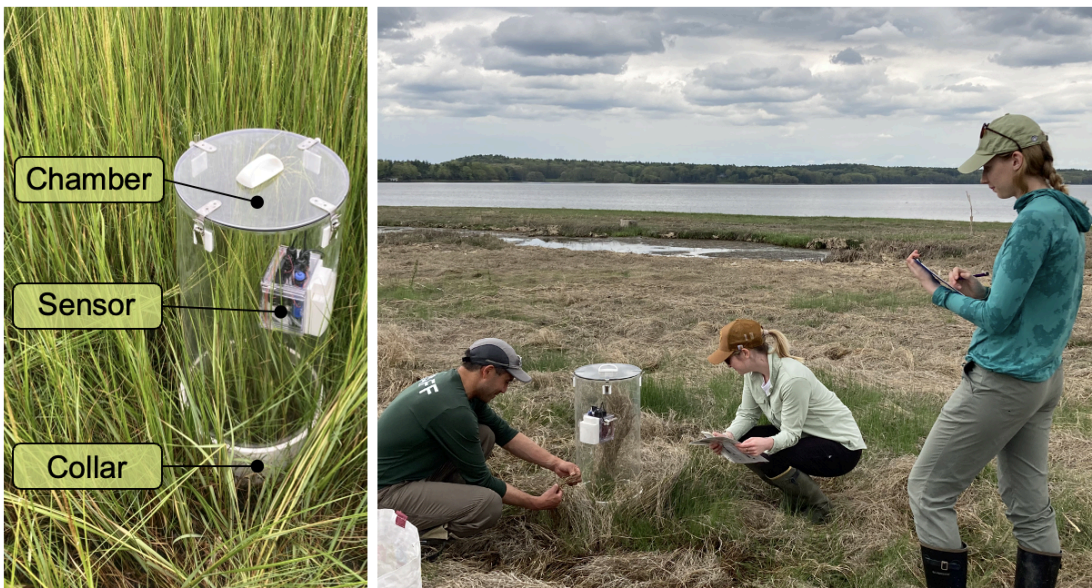
Field set up for closed chamber measurements using the novel sensor package.