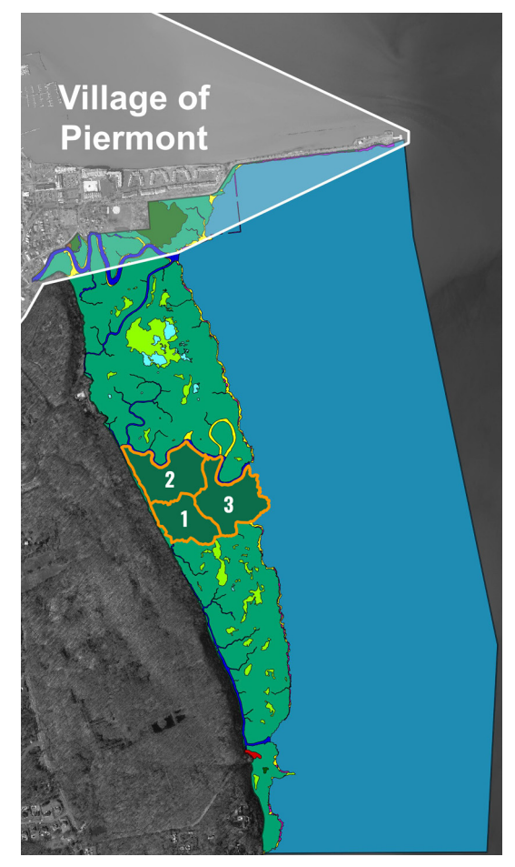
Figure 1: The Village of Piermont and Piermont Marsh, including three marsh areas formerly slated for a proposed vegetation management plan. A new plan is anticipated in 2021. The village and marsh lie 15 miles upriver from New York City.

A project to assess the value of Piermont Marsh in protecting coastal communities from storm surge and flooding amid a changing climate